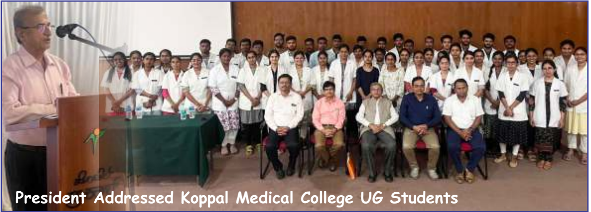
President Addressed Koppal Medical College UG Students