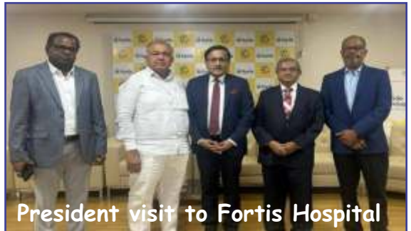
President visit to Fortis Hospital